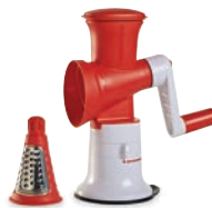
Grate Master™ Shredder